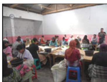
Hand sortation by worker (2012)