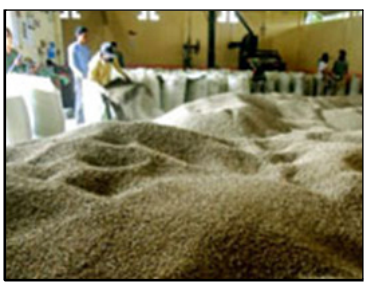
Warehouse activity (2012)